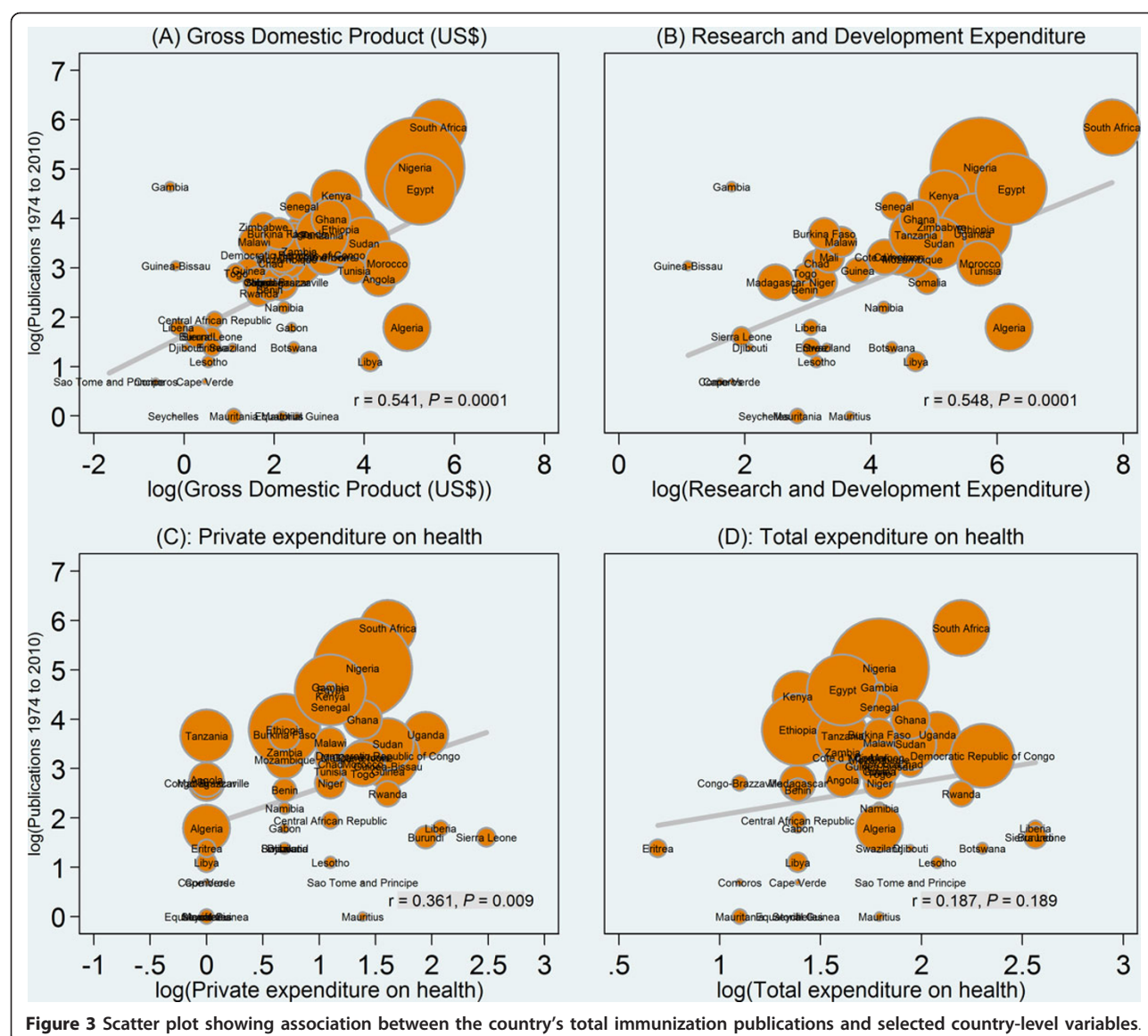
Table 4 Factors associated with childhood immunization research productivity identified by zero-truncated negative binomial regression models.