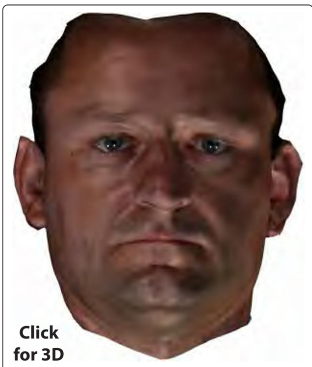
Additional file 1 Portable document format (PDF)-embedded, interactive three-dimensional (3D) model of a face. The 3D model was generated using an optical face scanner (FaceSCAN<sup>3D</sup>, 3D-Shape GmbH, Erlangen, Germany). This system measures the 3D shape of an object in less than a second using projected light patterns and a set of cameras. Applications of this methodology may include, for example, before and after surgery comparisons and the documentation of dermatological or orthopaedic patient characteristics. Scanning was performed on a healthy male volunteer. Activation of the embedded multimedia content requires the use of a PDF reader compatible with version 1.7 Extension Level 3 (for example Adobe Reader 9). Use the '+/- zoom' or 'toggle full-screen' options in order to maximize window size.

Interactive 3D imagery of human organs such as, for example, the brain is also available through the web (Table 1). However, most of the freely accessible brain models can be viewed only while the user is online, or require the installation of specialised software. In